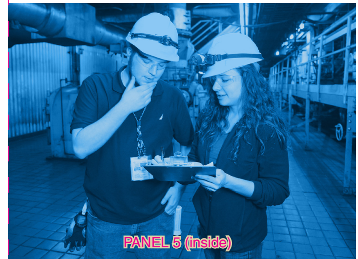
PANEL 5 (inside)

Before The Energy Systems Operations program is designed to prepare graduates to work in operations, maintenance, instrumentation and controls or other technically-oriented positions in the electrical power generating industry. By incorporating mathematics, physics, communication skills, computer technology, professional and industry safety standards to real-life learning experiences, graduates of this program are positioned to become successful entry-level power plant operators.