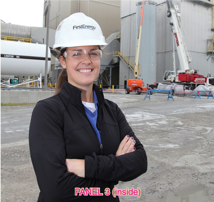
PANEL 3 (inside)

RightThe FirstEnergy Fleet Operations Diversity Scholarship is available to students with diverse backgrounds that have been historically underrepresented in the skilled craft trades, including Black/African American, American