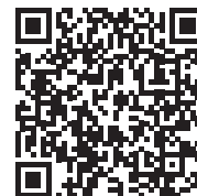
PANEL 4 (inside)